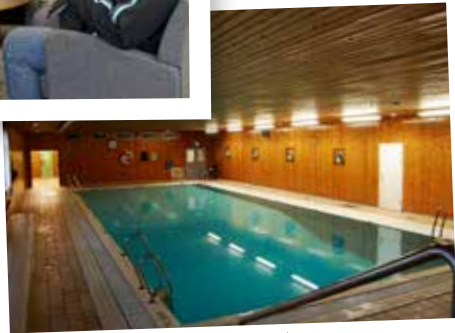
Our heated swimming pool.