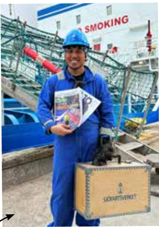
The Swedish Seamen's Library is located right next to Rosenhill.