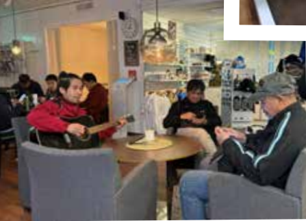
Chilling in the cafeteria.