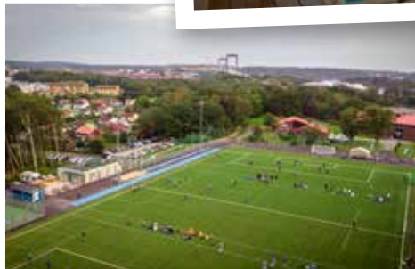
Football field with artificial turf.